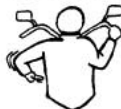
Time for a pit stop