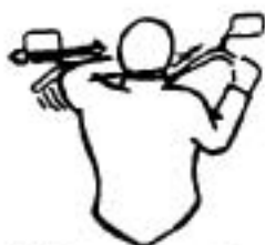
Stop your engines