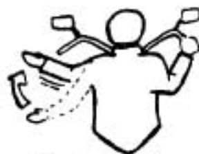
Go ahead and pass me