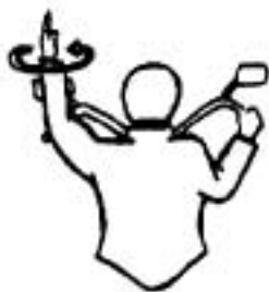
Start your engines