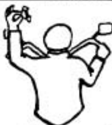
Turn off your turn signals