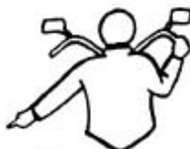
Hazards on the road