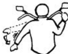
Don't pass me